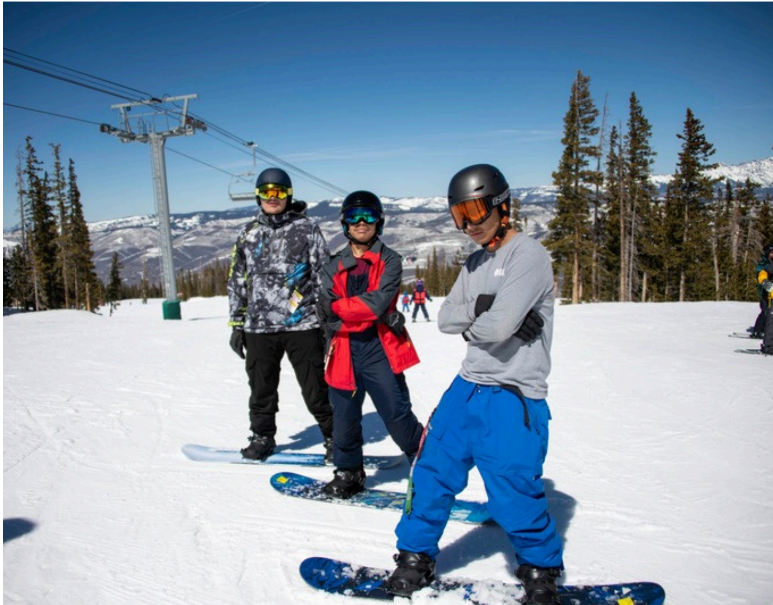
2025 Snowboarding Trip

"What I love most about volunteering with ELK is how much I get to learn about the environment and all the ways we can help sustain it. It's opened my eyes to new career paths and given me incredible opportunities to see beautiful places I might never have experienced otherwise. Plus, being surrounded by people who share the same passion makes it even better." - ELK youth (high-school aged), volunteer, and Urban Ranger, 2025