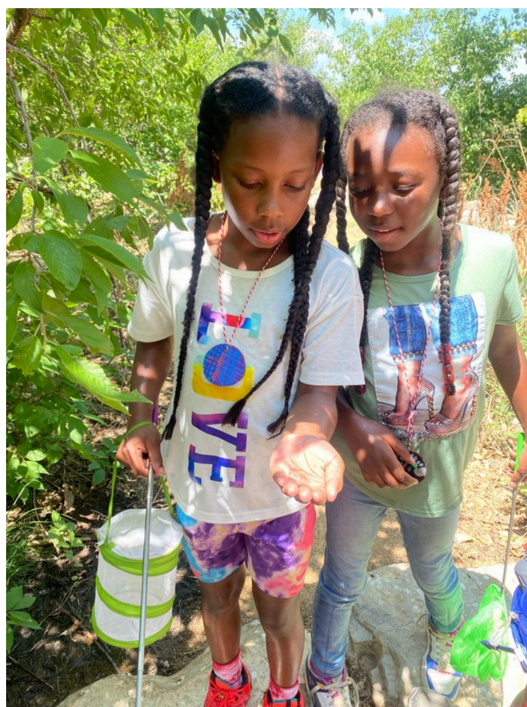
Bug Program at Sand Creek Park with youth from The Storytellers Project