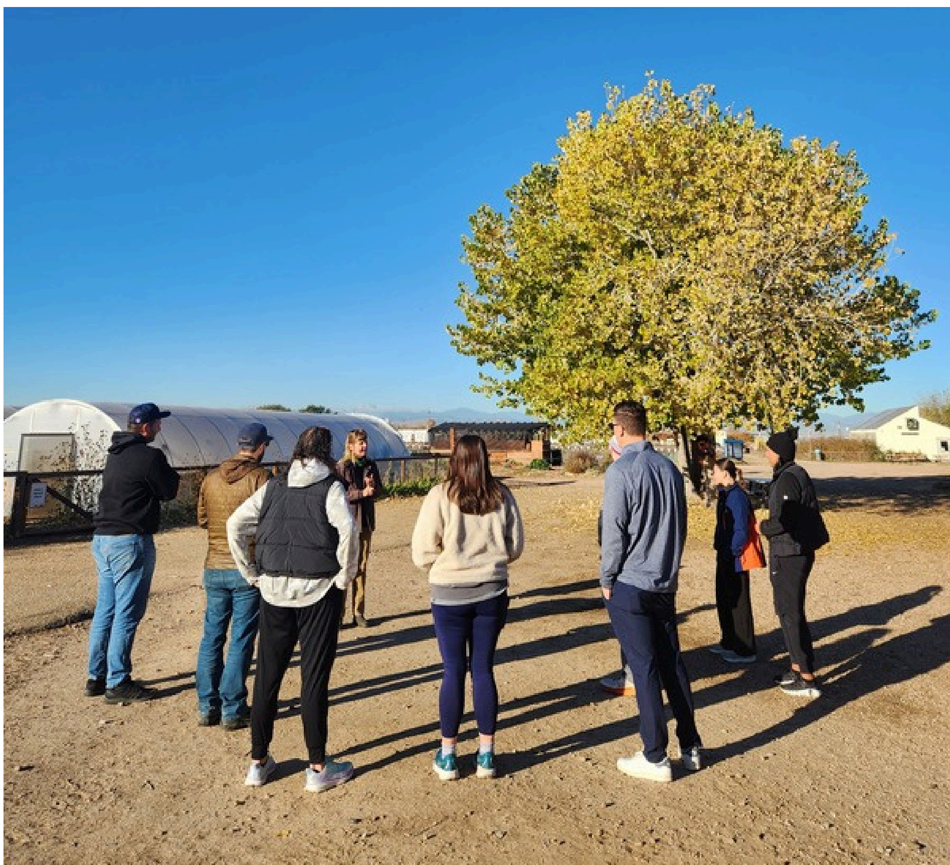
Tour of The Urban Farm