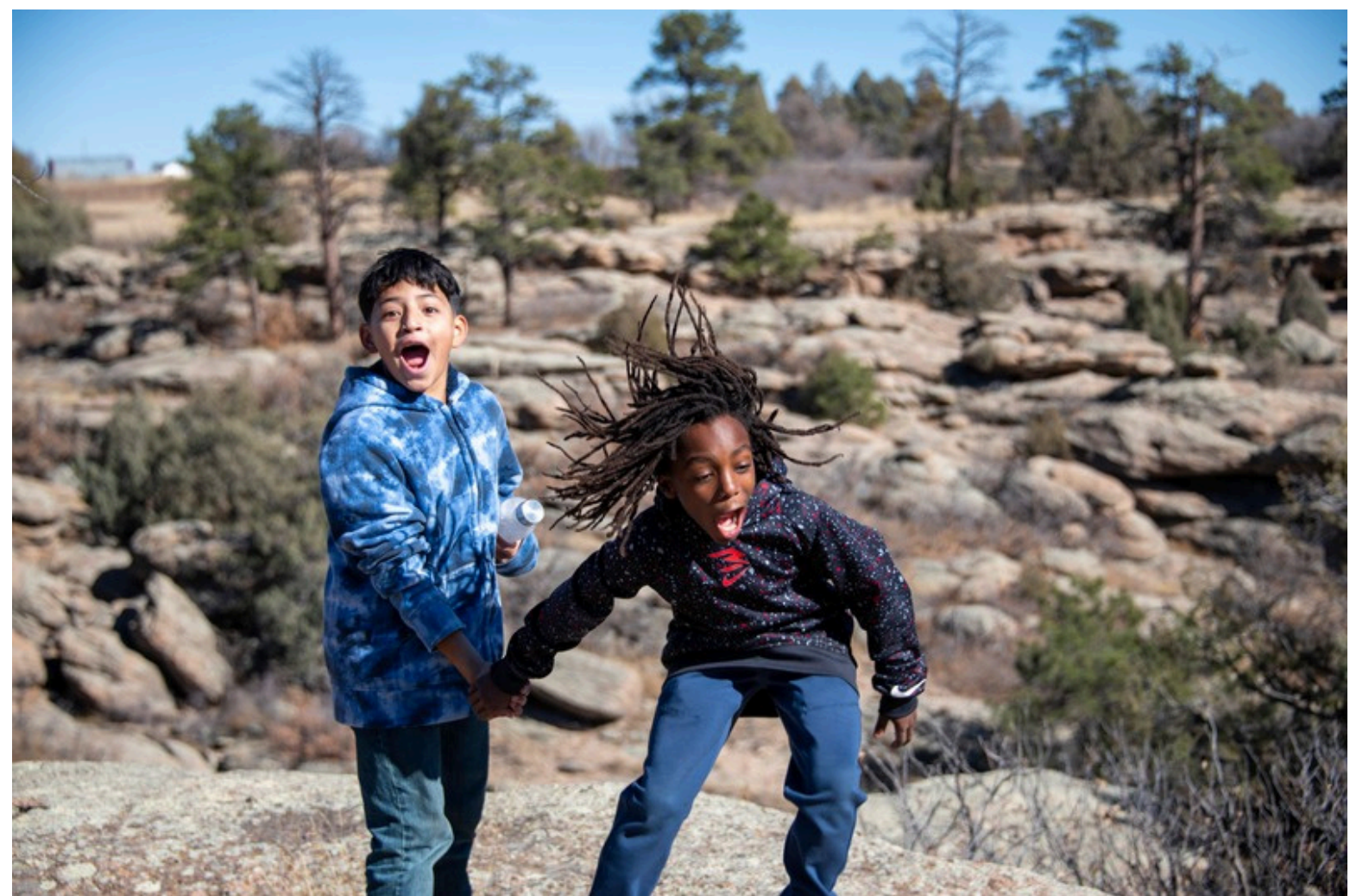
2025 LEAF Hiking Program

"For me personally, ELK has been a place where I can learn and experience. ELK has given me a lot of my firsts. I remember the first time I went fishing, it was with ELK. One of the first times I went camping, it was with ELK. Anytime I've stayed in a cabin — just so many experiences that we don't usually get here in the city area , I've gotten with ELK, and I'm so grateful for that because it's just been so lovely." - ELK youth (high-schooled aged), 2025