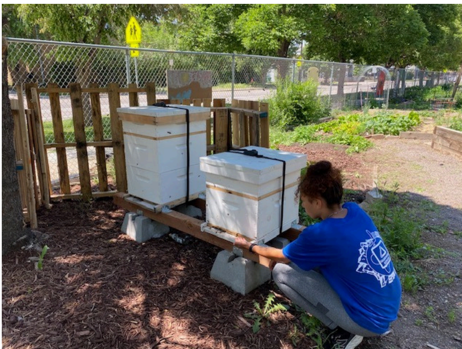
Green Team youth learning about beekeeping