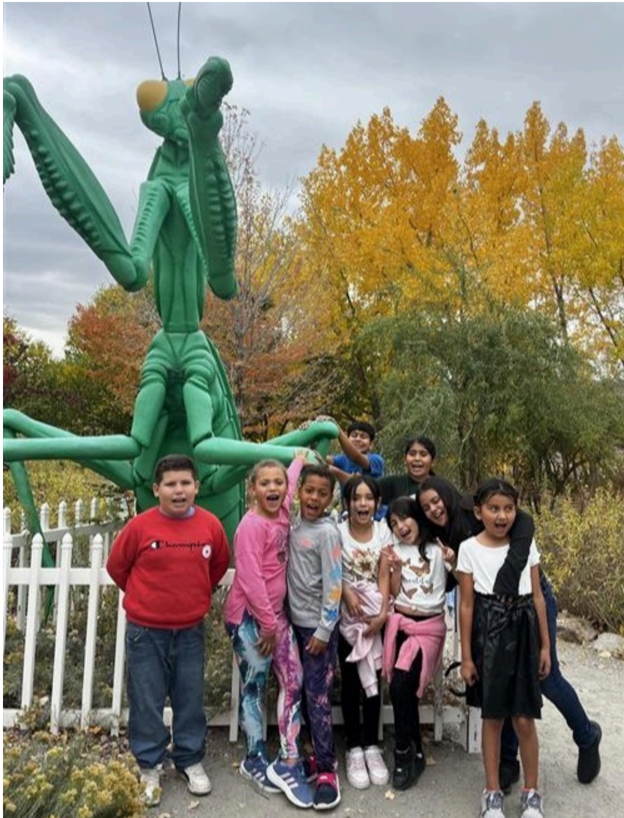
A group of Club Members with a preying mantis statue outside the Butterfly Pavilion

In March 2024, Members of Outdoor Adventure Club at Suncor participated in a butterfly observation program as part of their STEM program. The staff created an opportunity for members to witness caterpillars undergoing metamorphosis and transforming into butterflies. Throughout the program, they completed observation sheets several times each week while learning about responsibility, teamwork, and how meaningful change takes time . During spring break, participating members were rewarded for their consistency with a field trip to the Butterfly Pavilion. They enjoyed exploring the exhibits and discovering a wide variety of invertebrates. This engaging experience helped Suncor youth build a deeper appreciation for the complex and fascinating process of metamorphosis, making the program educational and memorable.