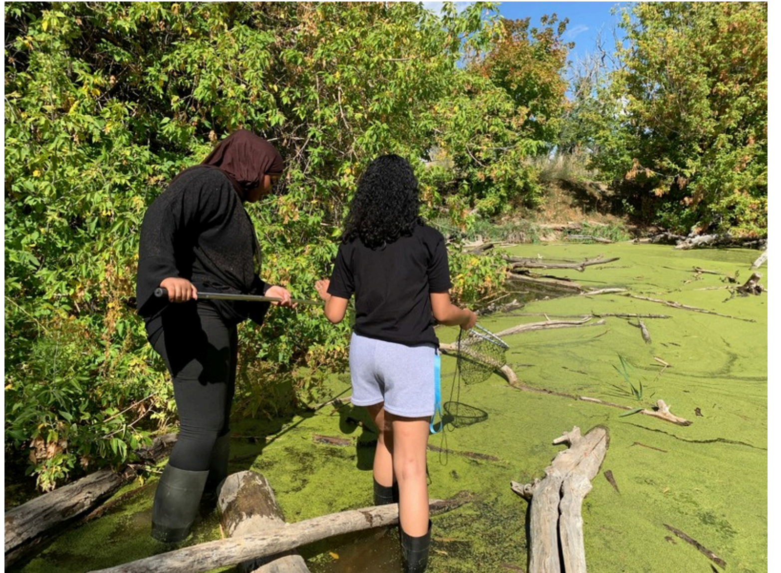
Aurora Science and Tech Students Taking Water Samples

"This is the best experience of my entire life! But my legs are tired." - Student