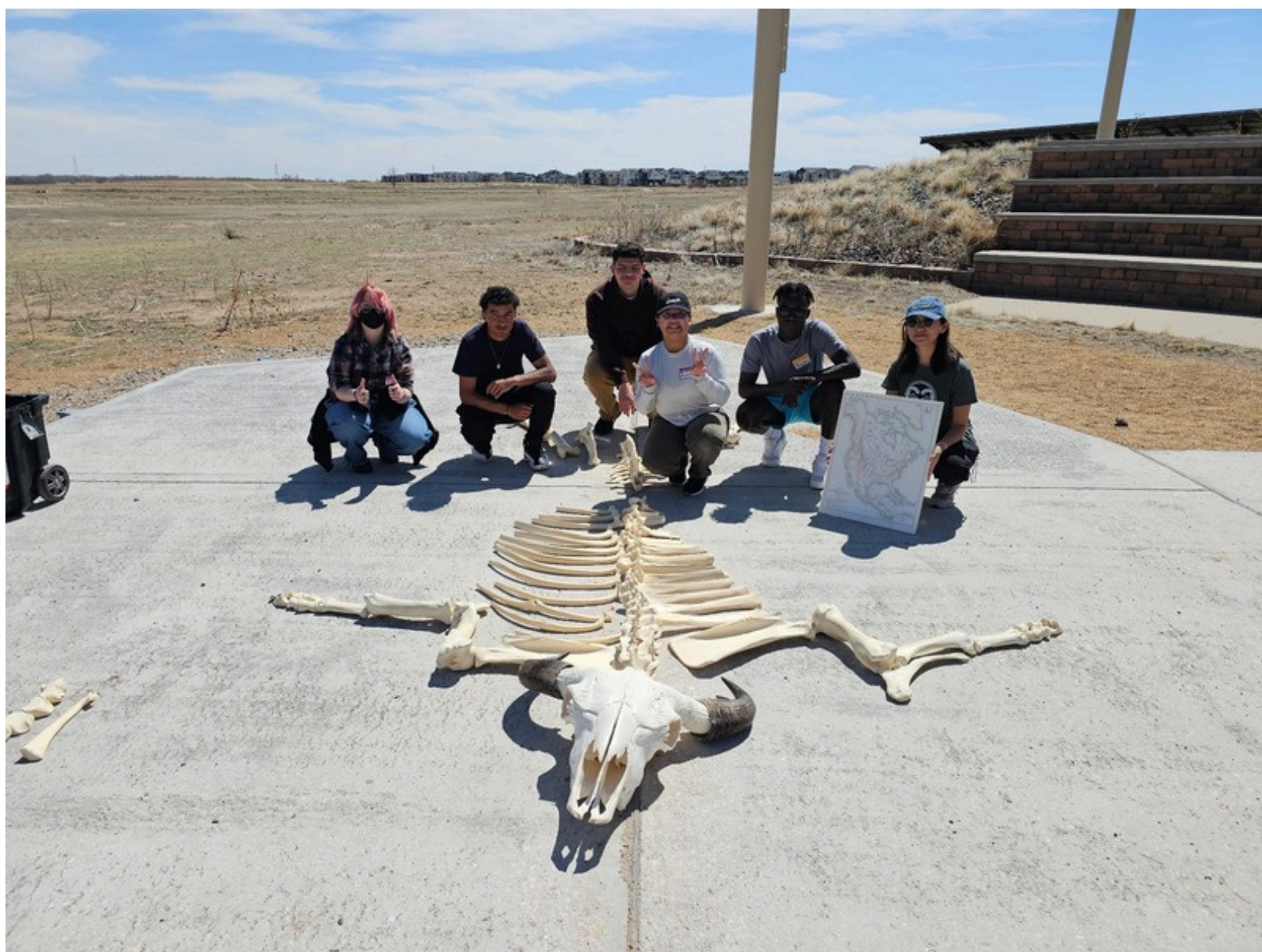
Build a Bison Activity

FRIENDS OF THE FRONT RANGE WILDLIFE REFUGES