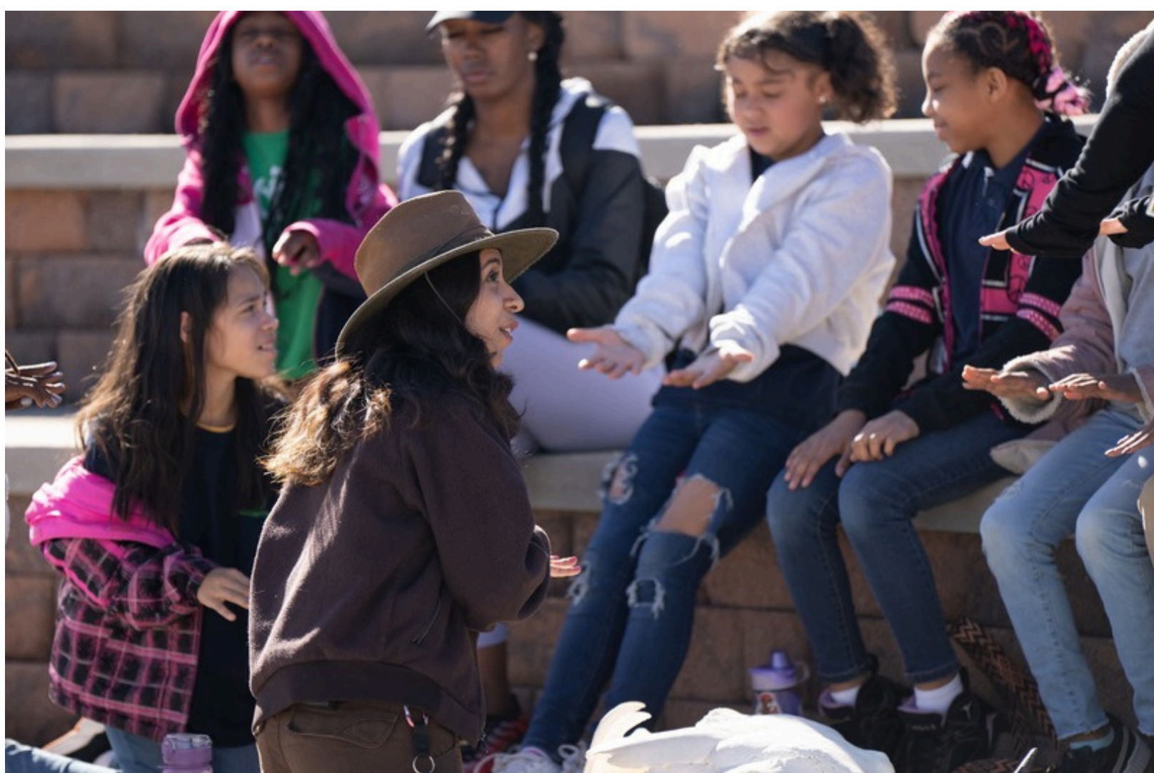
RMANWR Park Ranger Leading a Field Trip

“The Refuge is an open protected space, it’s a place for education/learning about the environment, the ecosystems we have right here in Colorado - and how people have to interact with it every day and keep it protected.” - Monaco Elementary Teacher