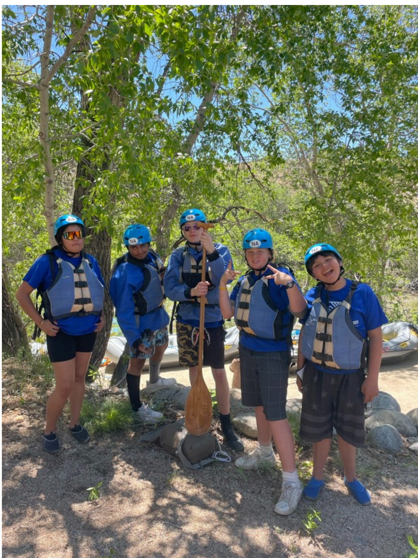
Club Members excited for their first whitewater rafting trip in Buena Vista

Boys & Girls Clubs across Colorado participated in a free rafting trip to kick off the summer in both 2024 and 2025 through a special partnership with the Arkansas River Outfitters Association. Teens from several Club locations traveled to Buena Vista to spend the day rafting, connecting, and enjoying the incredible beauty of the Arkansas River Valley . Participating rafting companies generously volunteered their time, expertise, and resources to provide lunch and an unforgettable whitewater rafting experience. For many youth, this was their first time rafting or visiting the mountains. Although it was a long and busy day, it was filled with laughter, teamwork, and lasting memories.