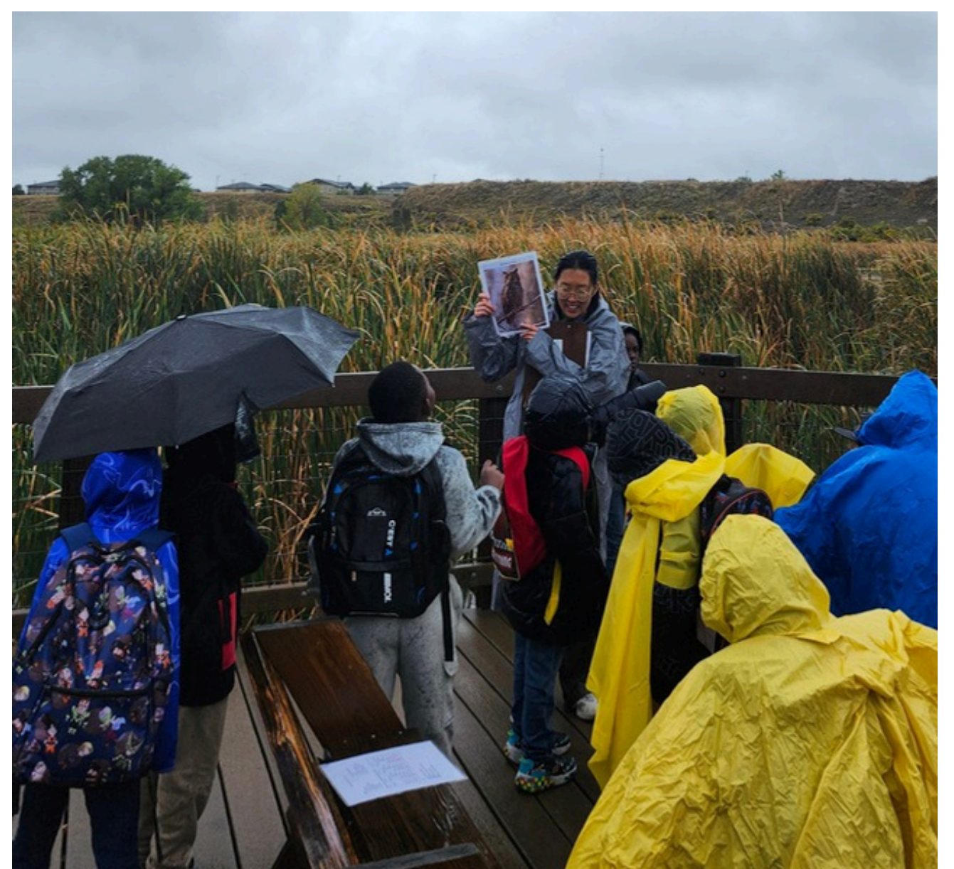
Crawford Elementary students learning about animals at Bluff Lake

"I have never been on a hike before. This is the best day ever! " - Student