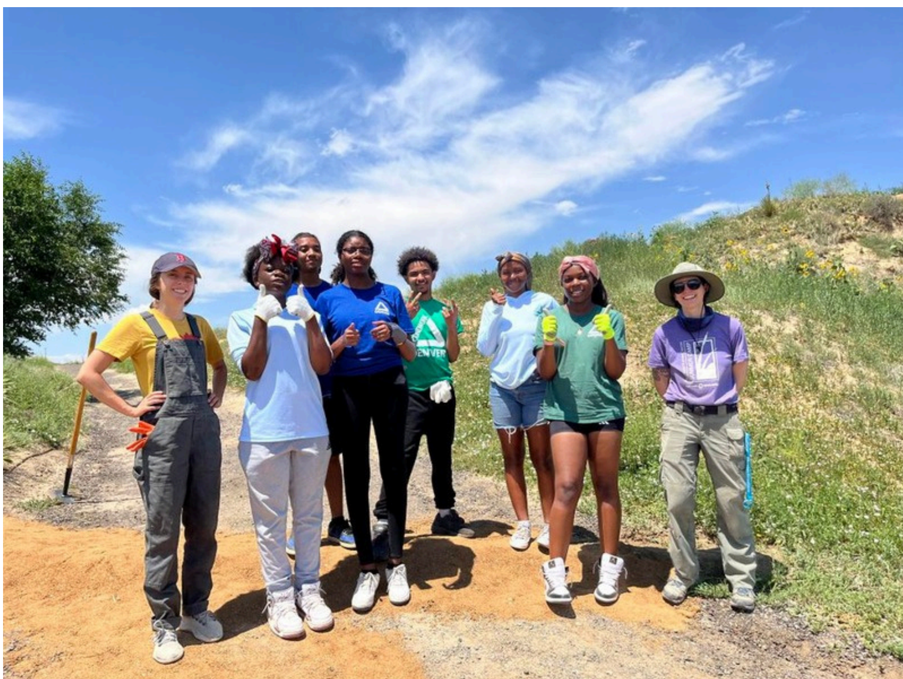
Green Team youth working with staff at Bluff Lake

"Being a part of the Youth Team isn't just a job, it's much more, it's a community. It's a family that's going to be there for you...it's honestly an amazing experience. I got to get my hands dirty, plants trees, help my community, and I learned more about my heritage. I even become friends with someone who I can already tell is going to be with me through the thick and thin." -Summer Green Team Member