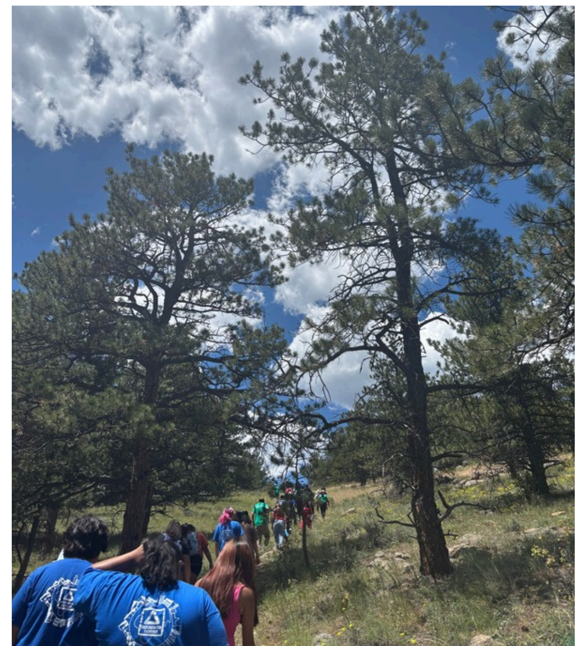
Green Team youth enjoying a hike in the mountains at Cal-Wood Education Center

"I learned how to plant a tree and surrounded myself with a lot more mother nature. I feel as if I taught myself more responsibility and life skills." - Summer Green Team Member