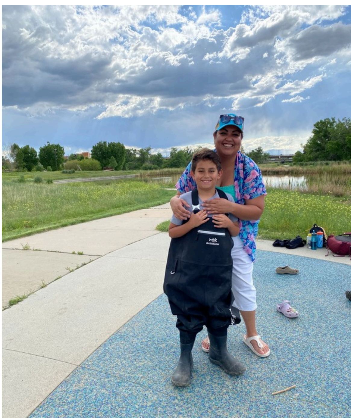
Folks from the community joined SCRGP staff for a fun water-bugs program in the Sand Creek