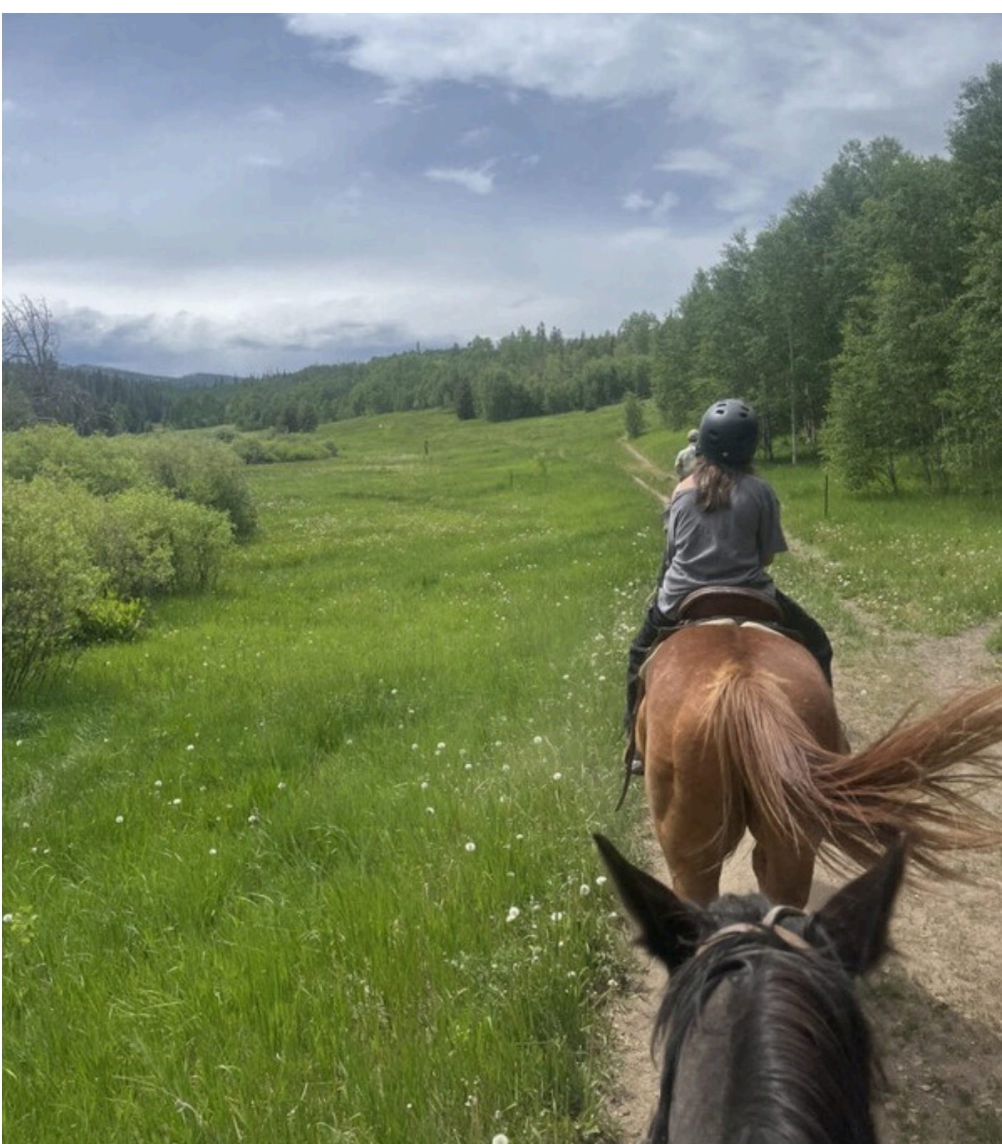
Horsebackriding with the Horse Trek Program

"Being outdoors, having new, fun, adventurous experiences, BEING AWAY FROM TECHNOLOGY, meeting new friends, making memories!! We absolutely love CC CAMP!!!!!! "