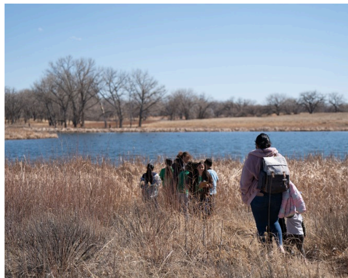
Wheels to Wildlife Field Trip at RMANWR

“We see lots of Spanish-speaking students through our Wheels to Wildlife programming and you can definitely tell how much of a difference it makes to have a Ranger who looks like them or can speak their language. I’ve gotten lots of excited comments from kids telling me I look like someone they know or that they have the same last name as me - and it is through those conversations and connections that they start feeling more comfortable and get the courage to ask lots of questions during their field trips . Teachers have also mentioned they’ve seen their students be a lot more engaged, and in the past, have been surprised by their participation, which goes to show representation in these programs also matters.” - RMA Park Ranger