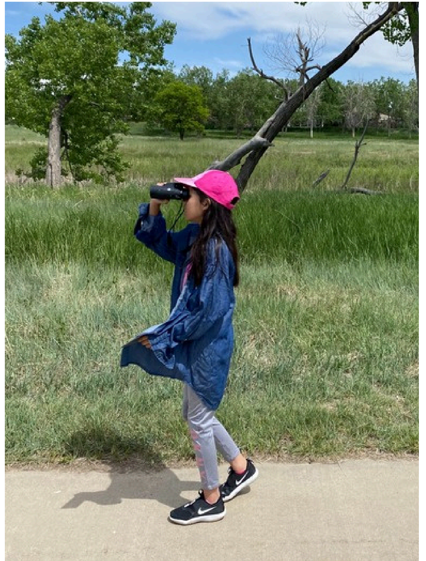
Looking for bird friends with BGCMD

“This was the best day of my life. It is a treasured memory.” - Montview Elementary BGC Student on a Field Trip