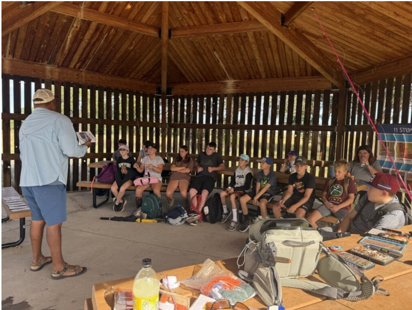
Learning to fly fish at the Rocky Mountain Arsenal National Wildlife Refuge

"Leaders are great! Love their enthusiasm and energy."