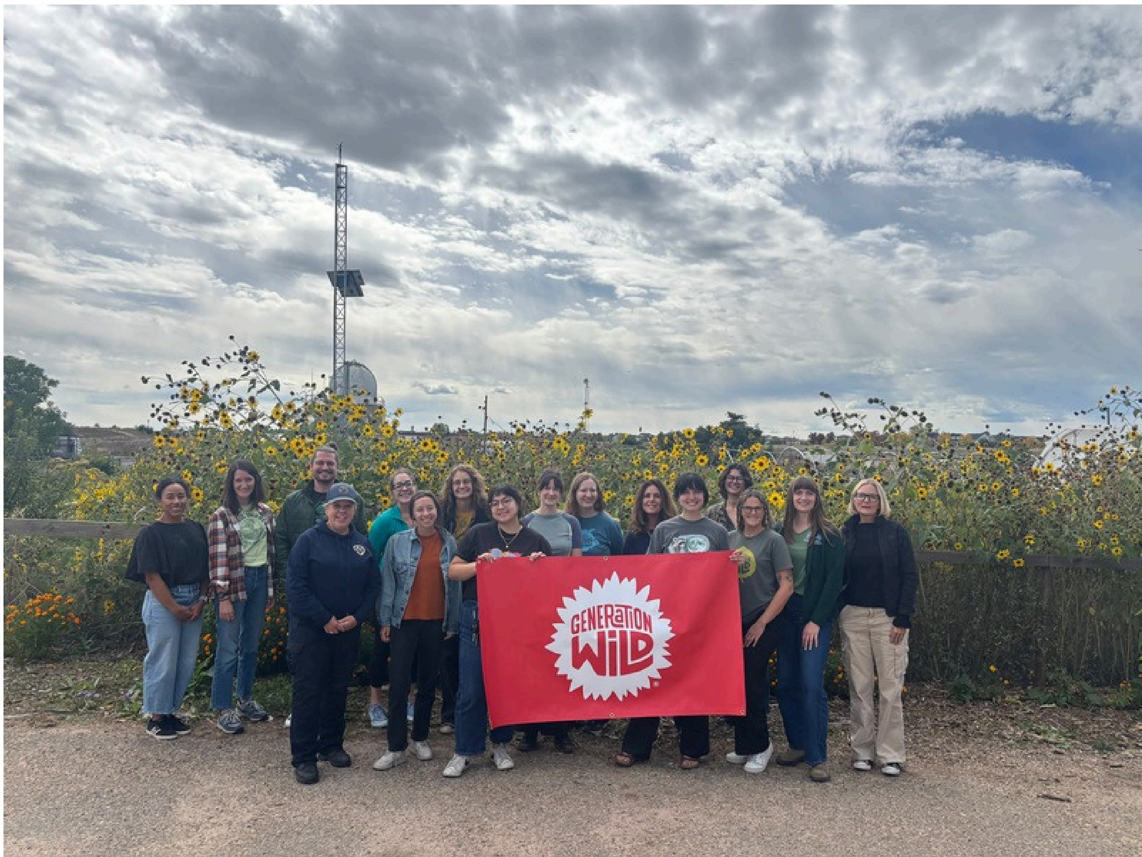
Partner Convening at The Urban Farm

Thank you for reading about our work in 2024 and 2025. We can't wait to share what we accomplish in 2026!