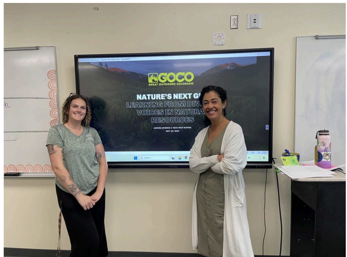
Nature's Next Gen: Learning from Diverse Voices in the Natural Resources a lunch and learn series

“As a Title I school-based administrator, I trust and rely on this program to support our students. We want our kids and families to have a connection to green space and the natural world . When students recall their elementary years, we know they will remember the live snake and turtle that visited their classroom, their field trips to the Aurora Reservoir, and the team’s interactive activities at our Community Nights.” -Community School Coordinator