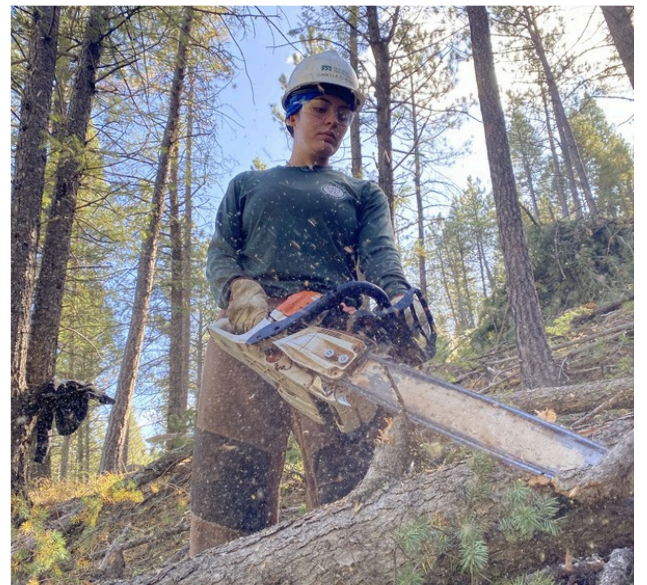
Corpsmember Utilizing their Chainsaw Training

“My experience with MHYC was the most fulfilled I’ve ever felt at a job! I can say with certainty that it has changed my perspective on the world and helped me to greatly develop as a person.” - Land Conservation Corpsmember