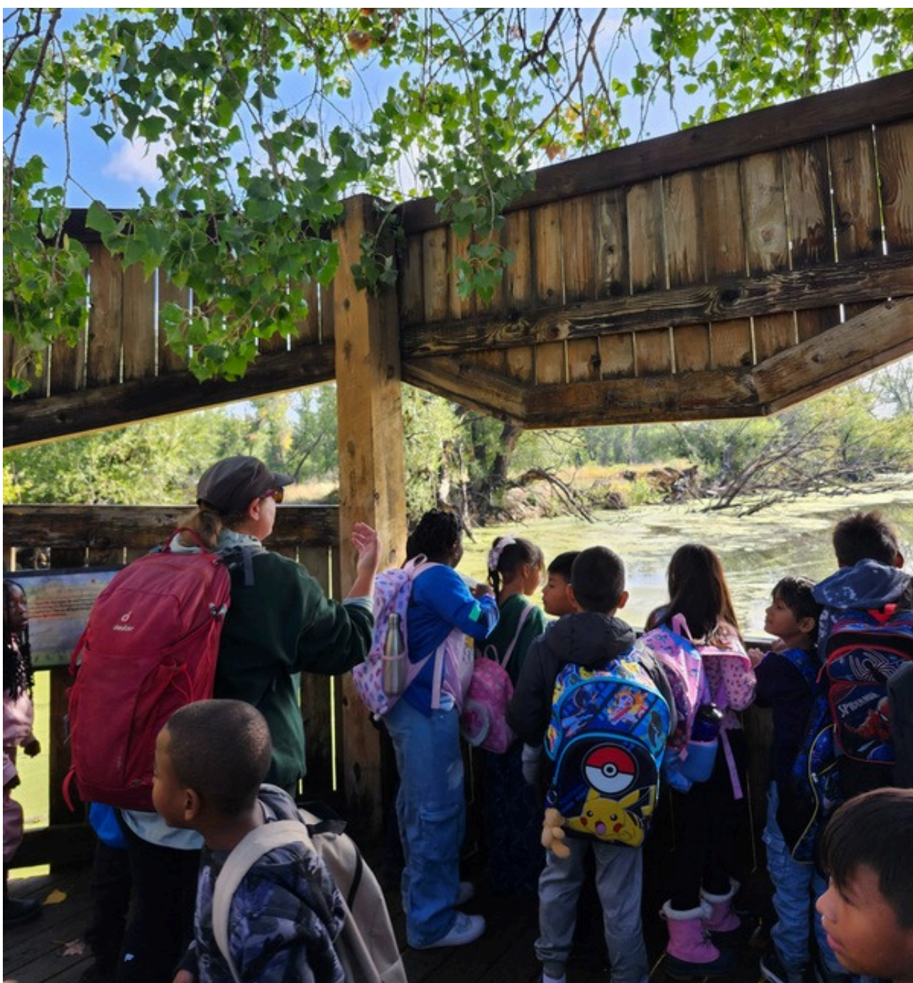
Crawford Elementary students learning about animals at Bluff Lake

"The best part was witnessing our students' joy in exploring the outdoors. They loved seeing wildlife (a snake, heron, eagles' nest, turtles), building with giant sticks, and pretending to be prairie dogs in the tunnels. Every student was thrilled to be outside in nature." - Teacher