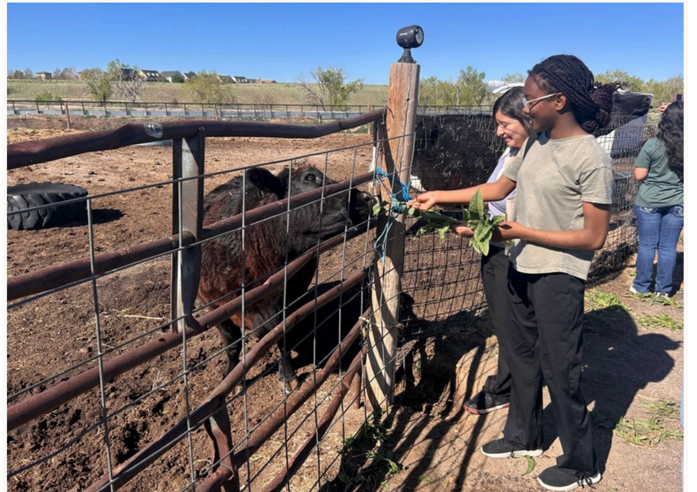
Visiting The Urban Farm to support an invasive weed removal project

We recruited a group of 11 middle and high school youth from the surrounding community to learn about and support our partner organizations through hands-on projects.