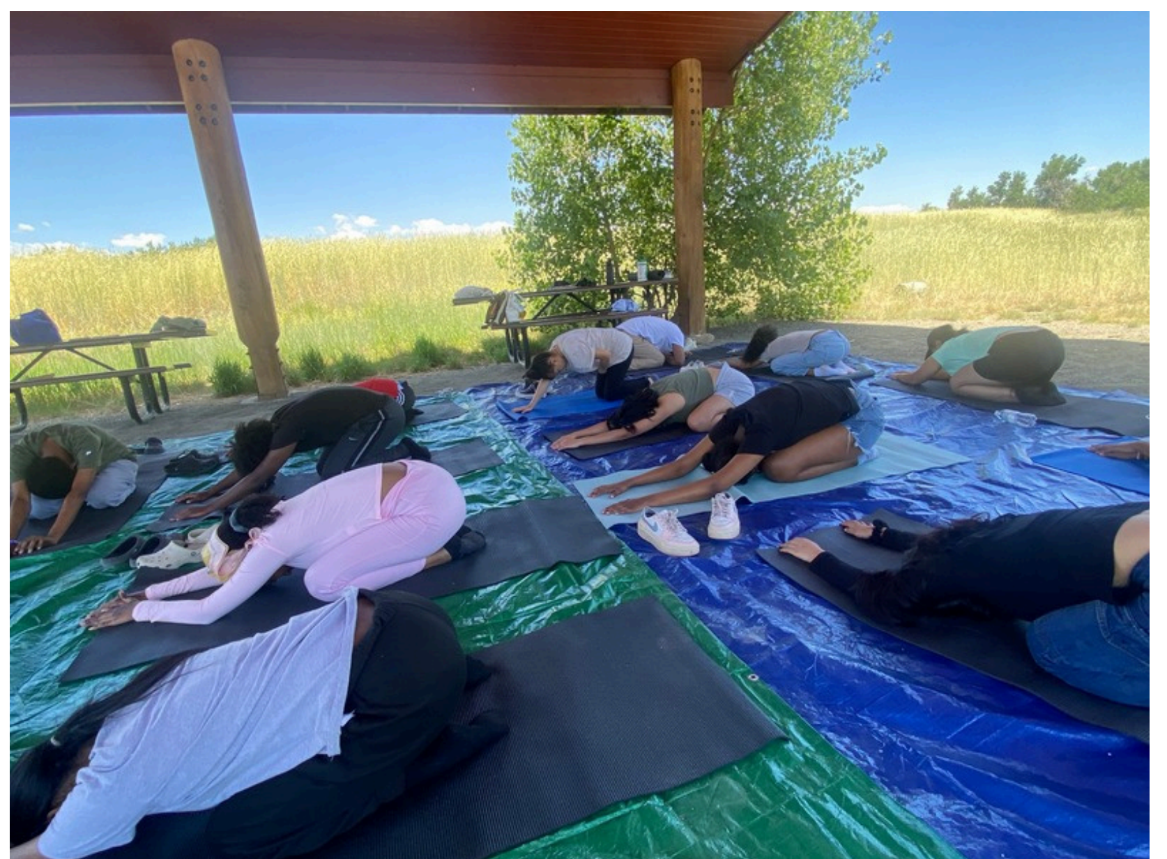
Students participating in a mindful movement program called Nurtured by Nature

“This unique program allows our students to connect with the great outdoors, which is often unsafe or inaccessible. The thoughtfulness and energy Ara Metz puts into each monthly group demonstrates a deep commitment to our students and a passion for providing access to nature for all. A few of our Generation Wild favorite activities include nature walks at Utah Park, morning yoga sessions, learning about snakes on the trail, and incorporating nature into art. Our students not only enjoy but eagerly look forward to the groups each month.” - Licensed school-based therapist