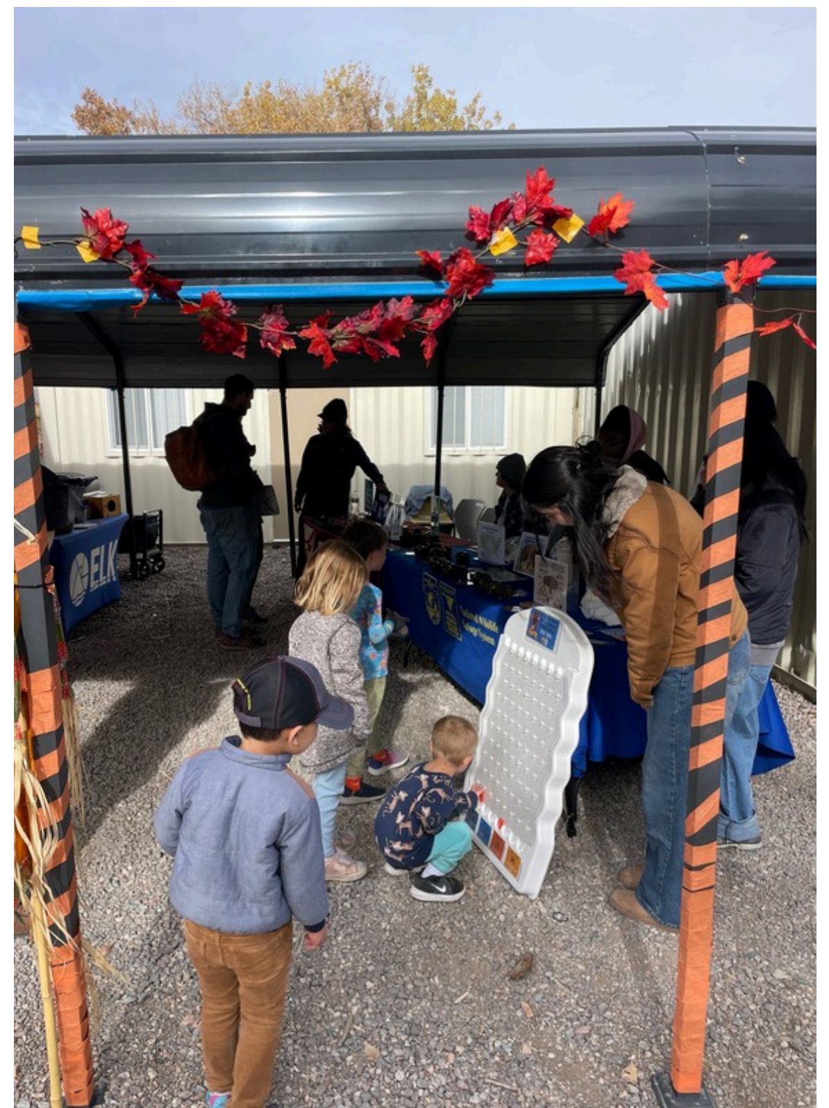
Youth Council members tabling at the community event Boo on the Bluff