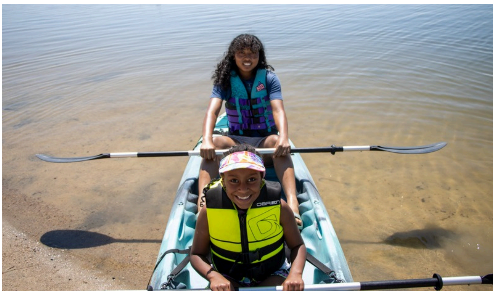
2024 LEAF Kayaking Program

"I love ELK because I like exploring nature, but I've never done it. When I was a child, we never could afford to do things like that, so I don't know how to fish or where to hike, and so it's nice to have this opportunity that I can bring my son, and I don't have to worry about not knowing because ELK gives us the tools ; they provide everything we need; and there's a sense of community. There's other kids here, so he can have a good time, too. It's just a really great program, and I'm very happy it exists. We get to hang out in nature without all the stress of knowing how to do stuff." - ELK Parent