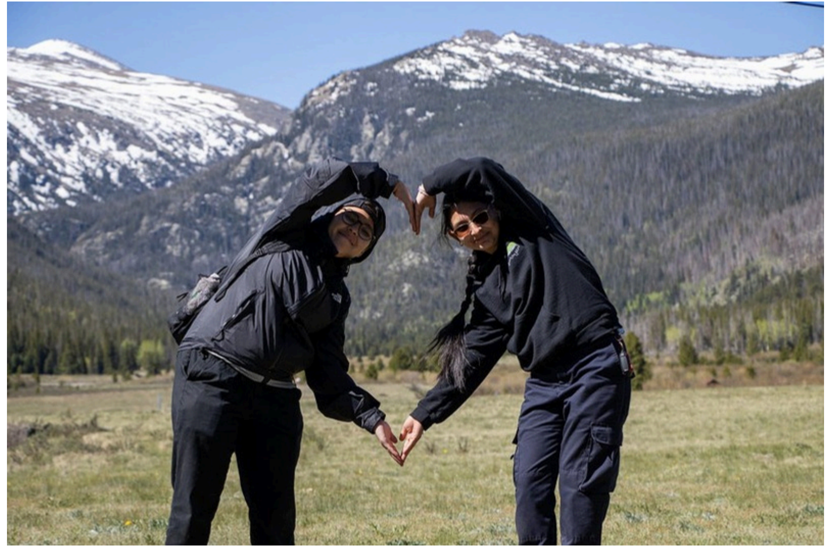
Urban Rangers in the Mountains