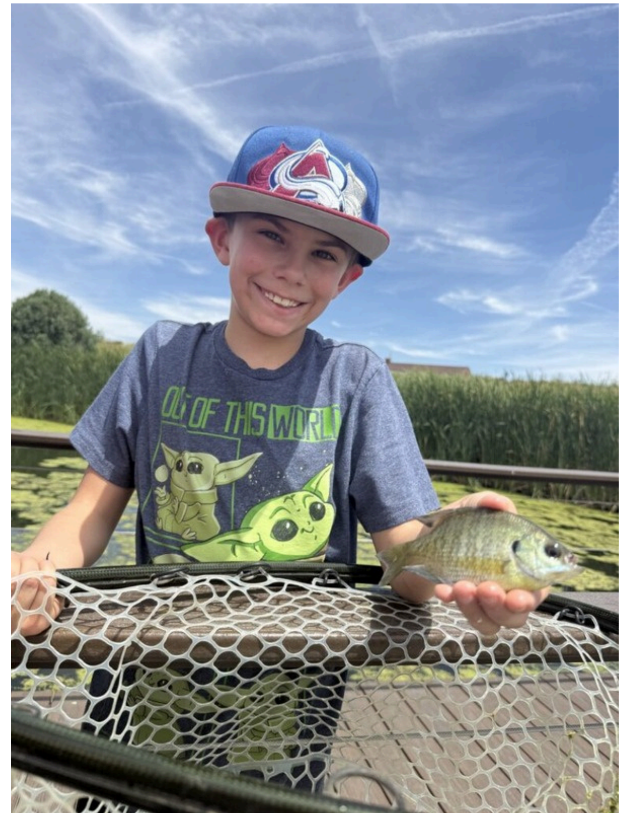
Learning to fly fish at the Rocky Mountain Arsenal National Wildlife Refuge