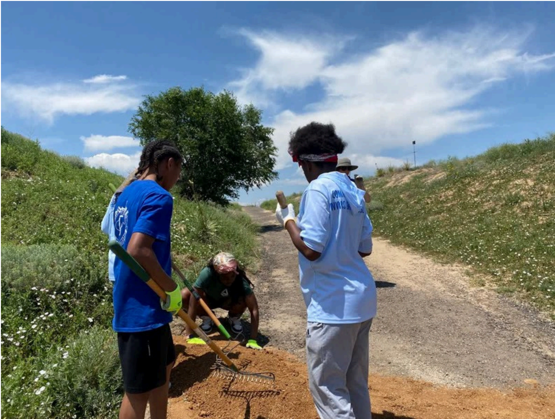
Youth working together to complete trail maintenance

"It was very pleasing to be a part of a welcoming team, working hard and helping our community." - Summer Green Team Member