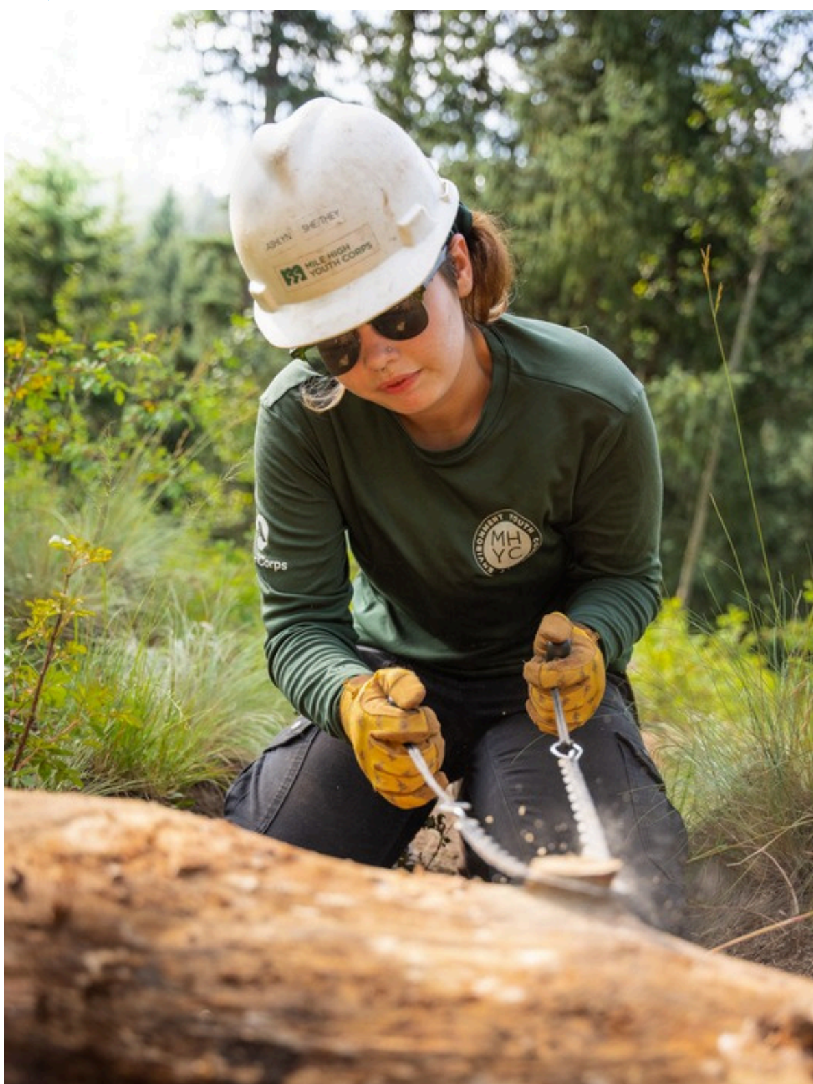
Land Conservation Corpsmember in the field

“It’s been a meaningful experience that’s helped me build practical skills and deepen my interest in conservation stewardship.” - Energy & Water Conservation Corpsmember