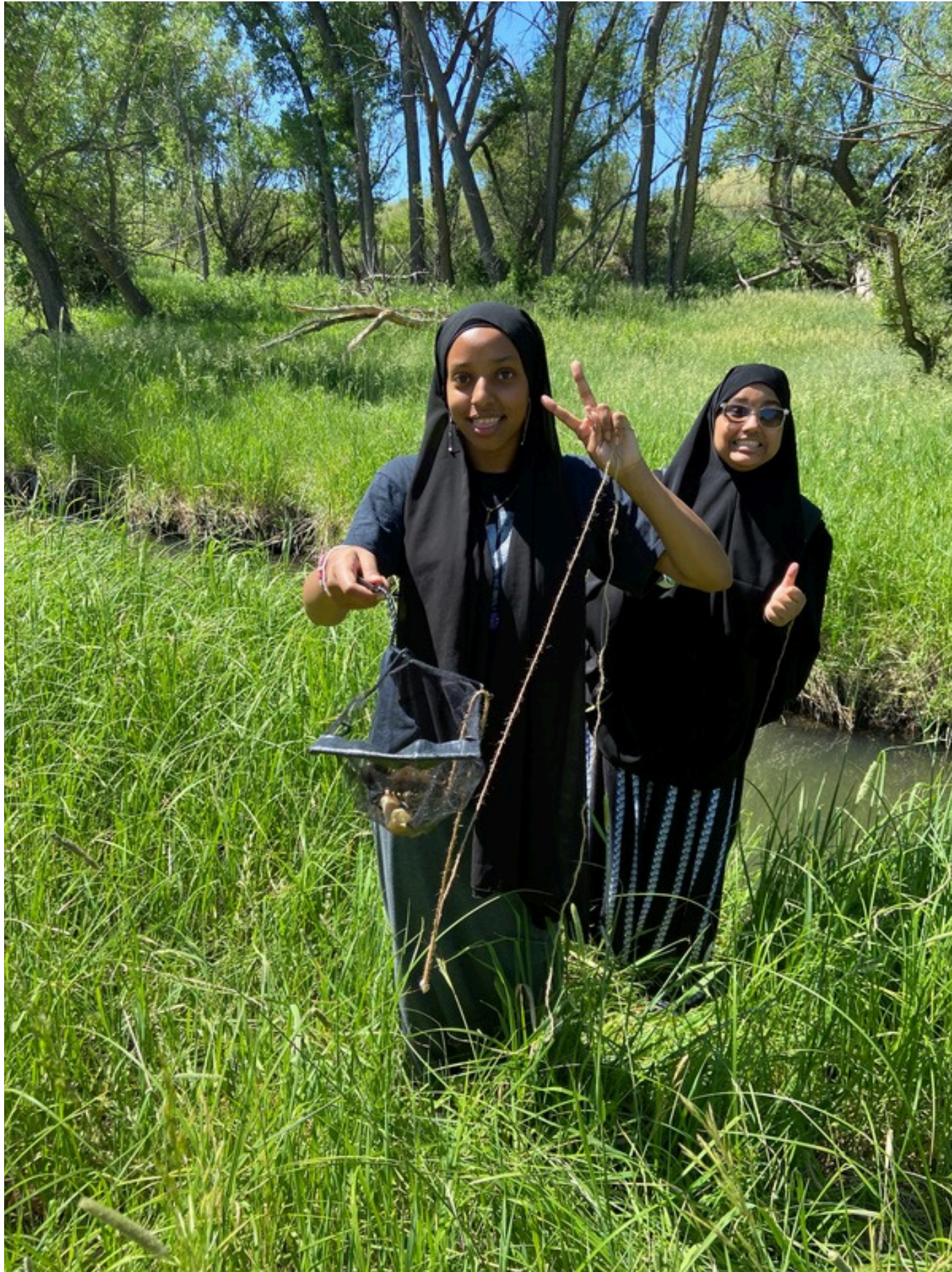
Two teens on a field trip with YAASPA pose with the crawdads they caught

“As a Title I school-based administrator, I trust and rely on this program to support our students. We want our kids and families to have a connection to green space and the natural world . When students recall their elementary years, we know they will remember the live snake and turtle that visited their classroom, their field trips to the Aurora Reservoir, and the team’s interactive activities at our Community Nights.” -Community School Coordinator