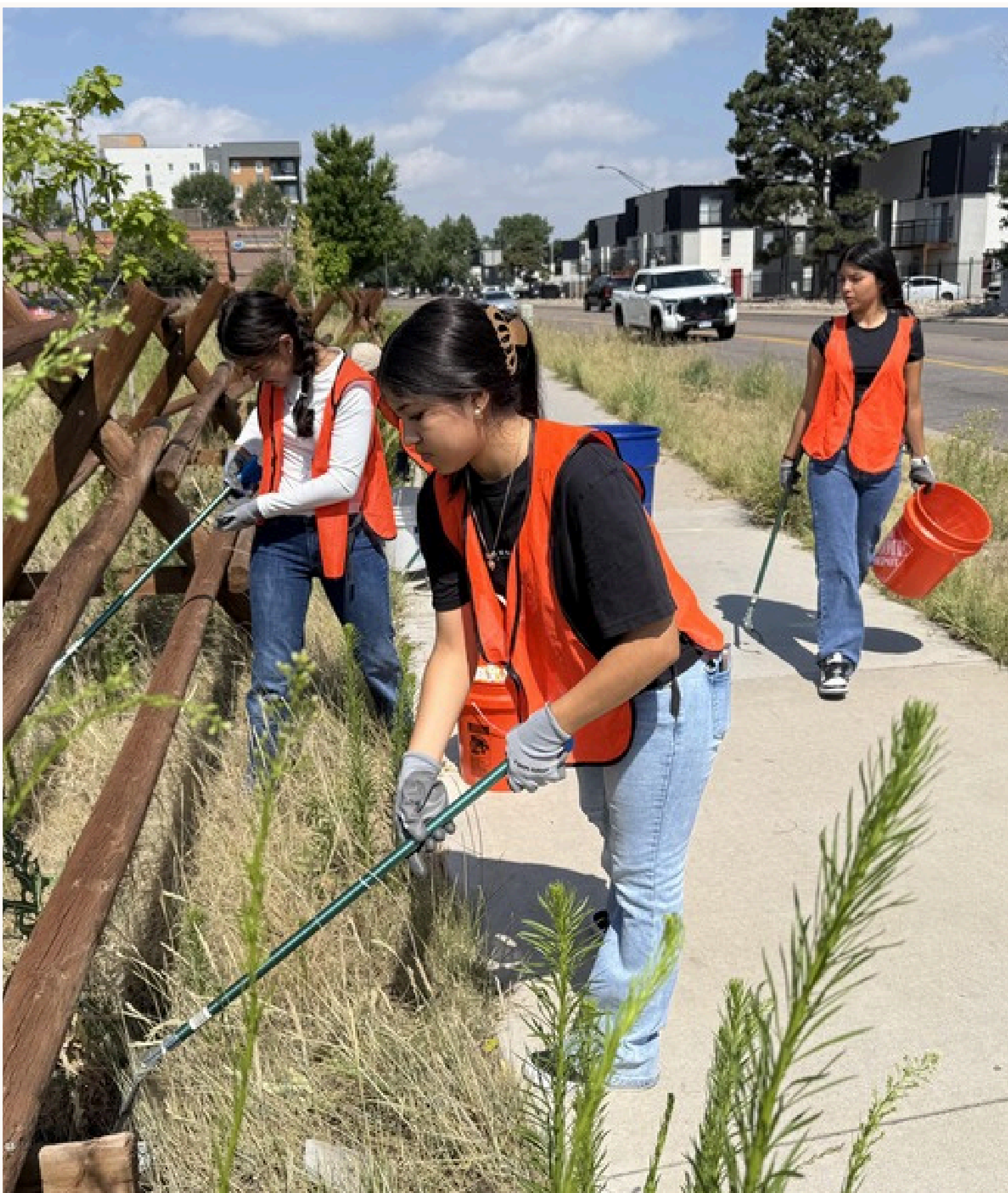
Trash pickup at Montbello Open Space Park