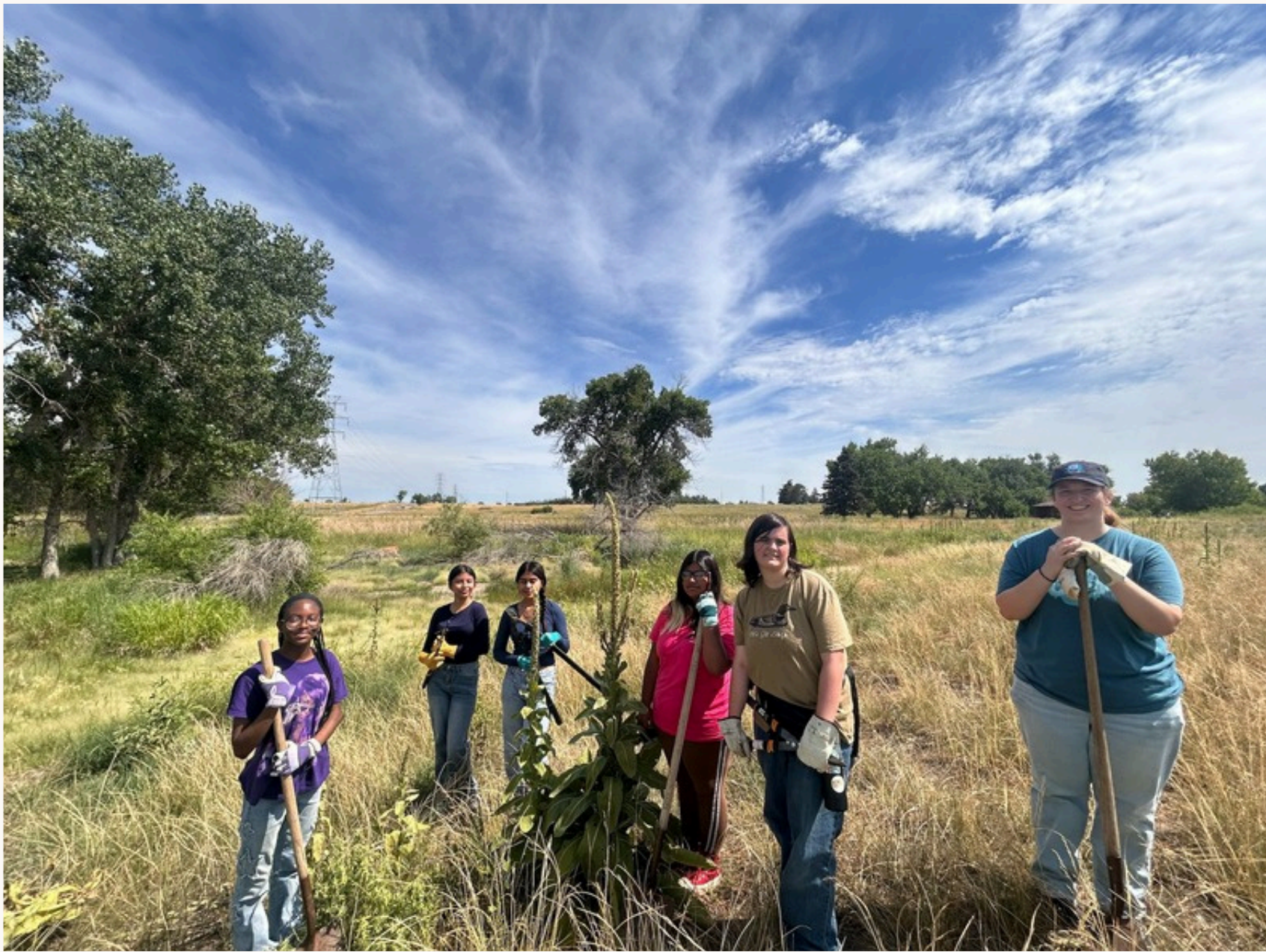
Removing invasive weeds by Lake Mary

We recruited a group of 11 middle and high school youth from the surrounding community to learn about and support our partner organizations through hands-on projects.