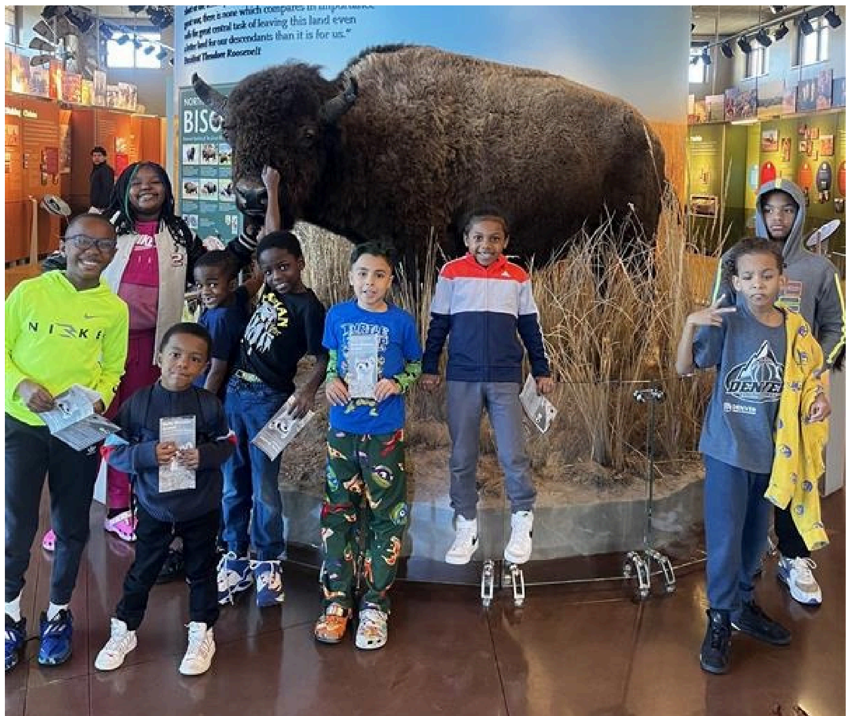
Members of BGC Outdoor Adventure Club posing with a Bison at the Rocky Mountain Arsenal Visitor Center

In March 2024, Members of Outdoor Adventure Club at Suncor participated in a butterfly observation program as part of their STEM program. The staff created an opportunity for members to witness caterpillars undergoing metamorphosis and transforming into butterflies. Throughout the program, they completed observation sheets several times each week while learning about responsibility, teamwork, and how meaningful change takes time . During spring break, participating members were rewarded for their consistency with a field trip to the Butterfly Pavilion. They enjoyed exploring the exhibits and discovering a wide variety of invertebrates. This engaging experience helped Suncor youth build a deeper appreciation for the complex and fascinating process of metamorphosis, making the program educational and memorable.