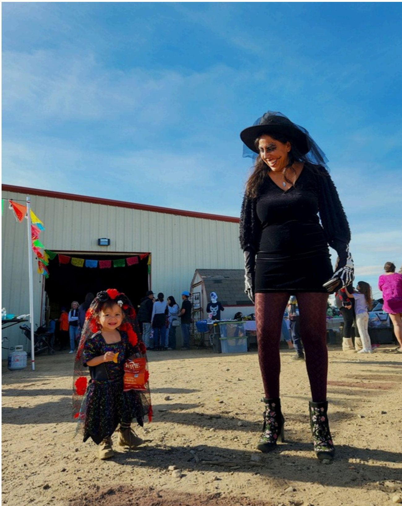
Our first Dia De Los Muertos was one of TUF's largest events to date. The high attendance speaks to the lasting legacy of Latinx heritage in today's Colorado.