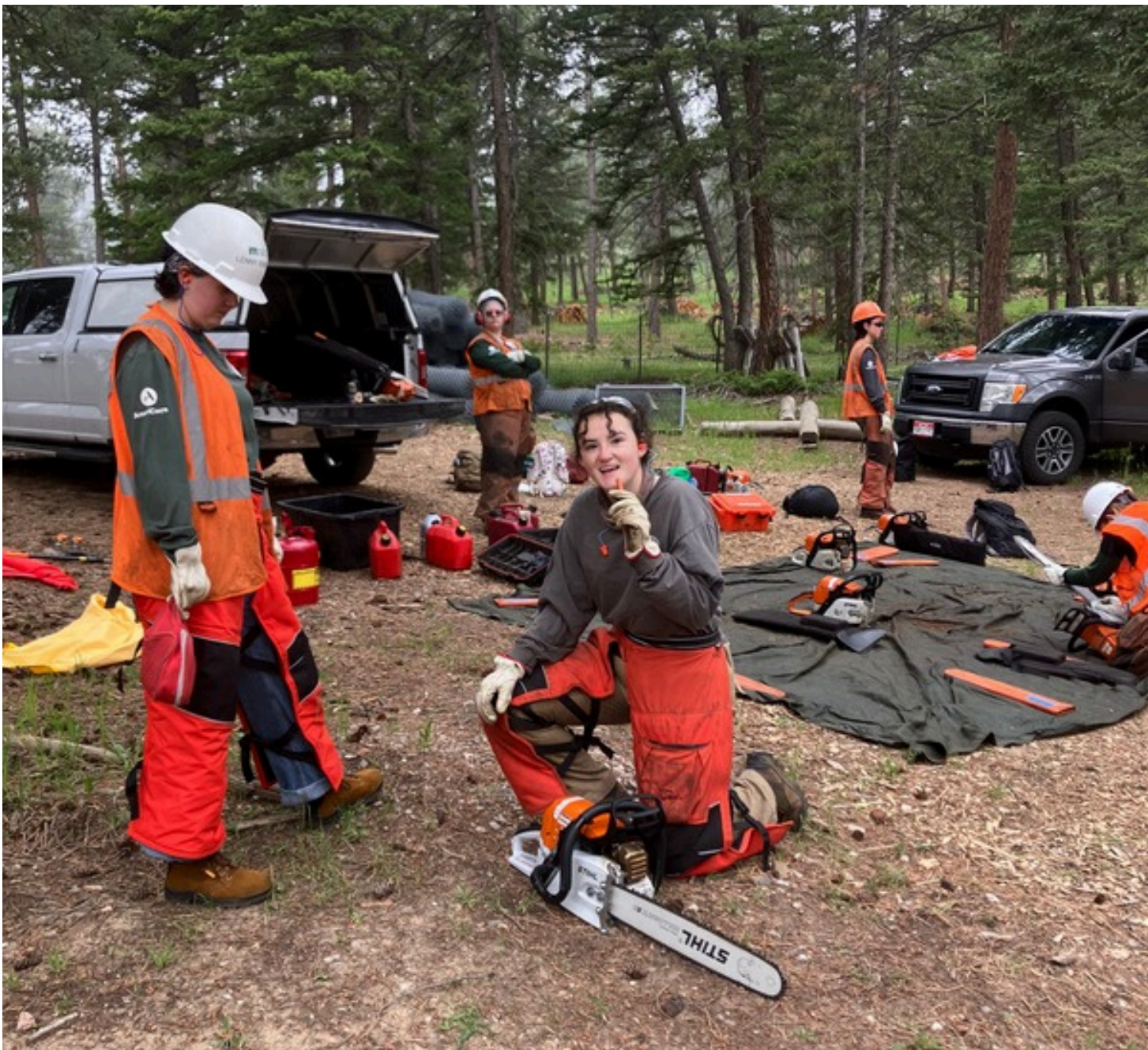
2025 Timber Trekkers Crew

“My experience with MHYC was the most fulfilled I’ve ever felt at a job! I can say with certainty that it has changed my perspective on the world and helped me to greatly develop as a person.” - Land Conservation Corpsmember